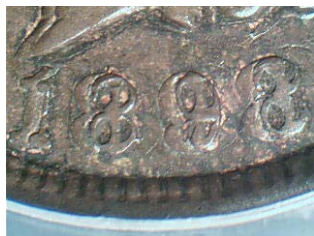
1898 Indian Cent Double Struck

ited to one pair of dies, thus the number of coins exhibiting a variety is usually less than a type. Each series of United States coins has a specific reference for the varieties that occur in that series. Early date large cent varieties are listed by Sheldon numbers, where as middle and late date large cent varieties are known by Newcomb numbers. Indian Cents are cataloged as Snow varieties where as Morgan Dollars are identified by VAM numbers. Collecting by varieties can significantly increase the number of coins required to complete a series, but it can also make the search rewarding and satisfying. Not only is there a challenge to complete the series there but there is also the chance that a new variety will be found.