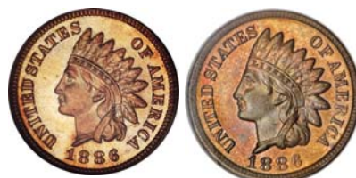
1886 Type 1 (l.) and 1886 Type 2 (r.)

nomination, nationality and principal devices." Collecting types usually involves collecting the different denomination or designs of coins over a period of time. It can also involve collecting the design changes within a given series. Typically in type collecting the differences are seen in multiple die pairings and a large number of coins of each type is available. An example of this in the Indian Cent series are the changes made to the composition, design or characters used to produce these coins. Some of the types in this series are the three types of 1864: copper-nickel, bronze or bronze with L, the Type 1 and Type 2 of 1886, or the open and closed three of 1873.