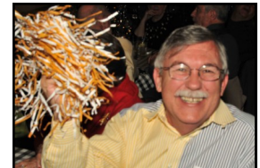
New Board member celebrates?