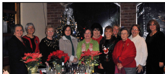
VIPs, also know as "Coin Widows." Thank you from MCCA. All of the VIPs have a special place in our hearts.