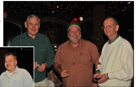
Gold and Silver Bullion Contest Winners!